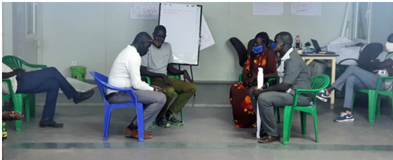
Participants performing a role play during the activity: 'Intimate Violence', 2021.

There has been an increase in demand from different Concern country programmes, and demand for continued engagement from countries that have previously received Sonke's visits. For example, the Bangladesh country office has requested Sonke to come for the third time in 2022 and assist them with conducting a mini-evaluation/review of the Engaging Men and Boys and Change Maker approach in the 'Improving the Lives of the Urban Extreme Poor (ILUEP)' programme. It is exciting to see this sustained interest and we look forward to continuing to work with Concern in engaging men and women in gender transformation.