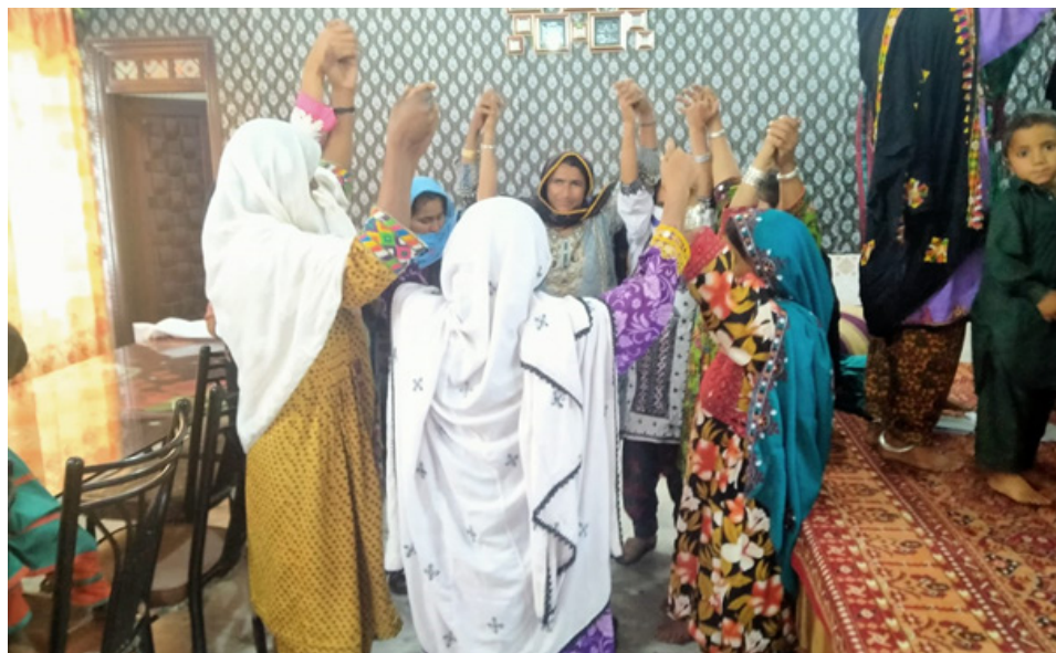
Participatory group works, Women Leadership and Negotiation Skills training for women Union Council level Disaster Management Committees members in Kashmore, Sindh, Pakistan.

In order to achieve the aim of gender equality, the activities should be agile and adaptable to changes in context so that there is no discontinuity in the process. For instance, a webinar series on 'Equity-based approaches to an effective and accountable COVID-19 response' was organized to highlight the differential impacts of COVID-19 on men and women. The first webinar in the series was broadly focused