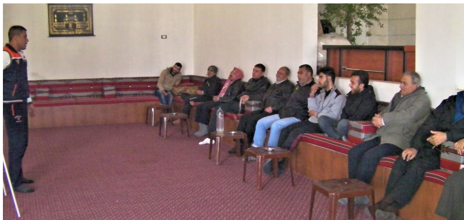
Men’s session, North Lebanon (names of participants and photographer redacted to protect identities).

women and men. Our ultimate aim is to move from ‘gender-sensitive’ to ‘gender-transformative’ programming. Gender transformative programming seeks to challenge and transform rigid gender norms and relations that can be harmful within communities.