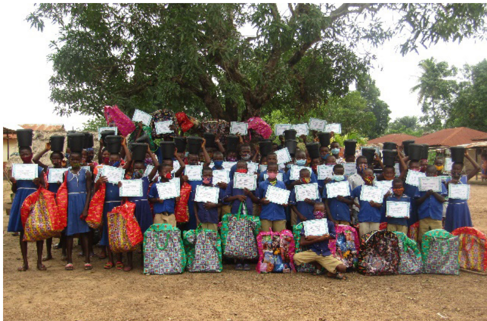
In-School Adolescents at their ASRH graduation, Warrima Tonkolili District, June 2021

Our ultimate dream is a Sierra Leone that strives to protect the rights of every adolescent girl, creating the space to voice their opinion with confidence, to share their views without fear and intimidation, and identify their needs and access resources equitably regardless of their gender.