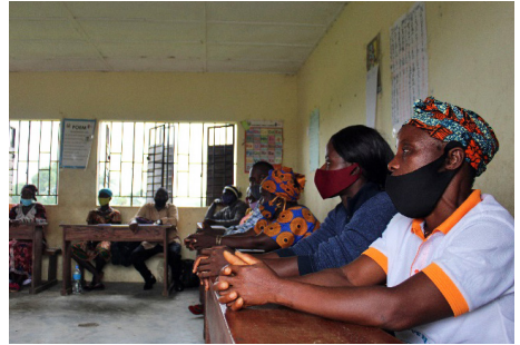
ASRH SRGBV Session with teachers and parents, Yele, Tonkolili District, August 2021.

Our approach is focused on changing the context around the adolescent and then giving them the skills to think critically and to understand their rights simultaneously; increasing the opportunity to claim these rights and exercise decision-making.