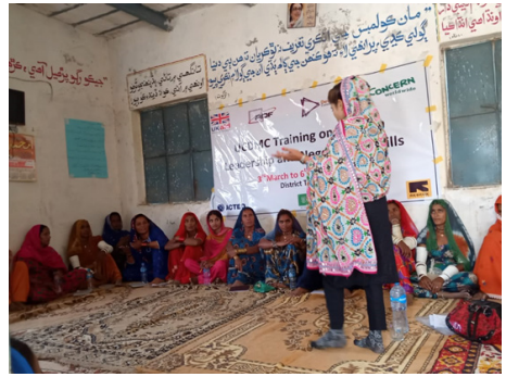
Women Leadership and Negotiation Skills training for women UCDMC members in Tharparker, Sindh, Pakistan, Photo: Devtrio, 2020.

The findings were also confirmed by a detailed gender analysis conducted for implementation phase-II that established that men need to be engaged and sensitized for meaningful inclusion of women in both development and humanitarian projects. Subsequently, this approach was applied to facilitate meaningful participation of women in development planning within Disaster Management Committees (DMCs) by encouraging support of women by male Change Agents (male DMC leadership/ community gate keepers). At the end of the training, the participants made a plan of action with highlights of how to ensure maximum support to women counterparts both in committees and at household level. This approach was quite successful in terms of ensuring meaningful participation of women in programme activities especially at decision-making level of disaster management committees.