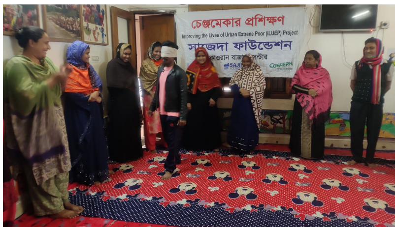
Change Maker training session with Sajida Foundation in Karwan Bazar, Dhaka, 2019.