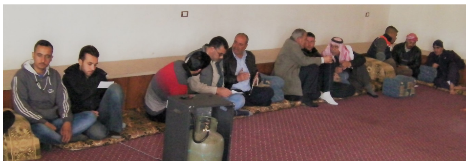
Men's session, North Lebanon (names of participants and photographer redacted to protect identities).

Concern Lebanon's psychosocial support programming and, in particular, its Engaging Men approach were evaluated in 2016 by University College Cork (UCC) and the American University in Beirut (AUB), and in 2020 by the Balamand University. The UCC evaluation found that within their families, results indicated many men expressed greater empathy towards their wives and their needs, and increased dialogue and positive time spent with children. The Balamand University evaluation reported that the intervention was effective amongst men, women and children given the reported changes in behaviour and attitude following the sessions.