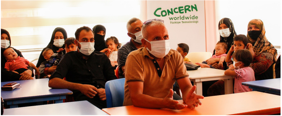
Caregiver engagement session in Ceylanpinar, 2021.

Based on Concern’s global Caregiver Engagement & Family Literacy curriculum, the Turkey Caregiver Engagement programme was initially conceived as an extension of Concern’s existing Education programming and a recognition that the home, school and community affect children’s learning and development. In 2018, the Concern Turkey team adapted the global curriculum to fit the Turkey context and piloted the programme in early in 2019. Since then, the curriculum has been updated several times to include sessions on adolescent brain development and learning needs, screen time and its effect on child development and education opportunities for children with disabilities.