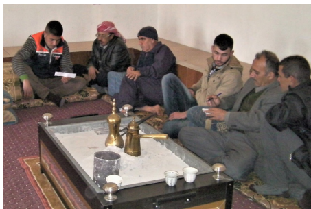
Men's session, North Lebanon (names of participants and photographer redacted to protect identities).

Policies issued by the Lebanese government since 2015 have tightened regulations over Syrian refugees, significantly restricting their mobility and their access to work opportunities. Daily life stressors have become magnified for many Syrian refugees in recent years. Stress related to fears of deportation, having no means to earn a living, and the impact of roadblocks on their mobility, labour participation and community life; their sense of claustrophobia and of living their life in an open prison have impacted their ability to contribute to the needs of their family such as to pay rent and provide food so their first priority need was related to daily survival. The impact on their families includes begging, engagement of children in the worst forms of child labour, foregoing educational opportunities, and increased instances of early marriage. Further analysis