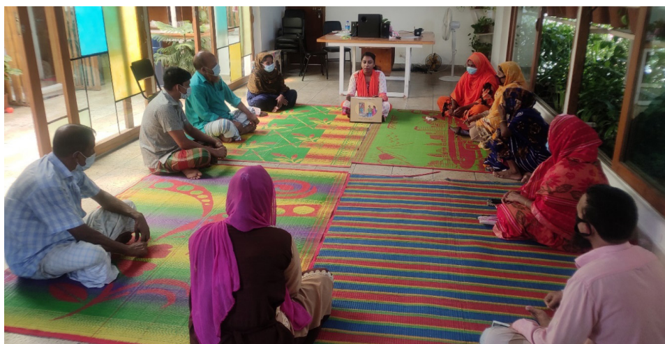
Change Maker session run with Sajida Foundation in Maniknagar, Dhaka, 2020.

EMB utilises a number of participatory methodologies. A three day long training is used to identify and train community