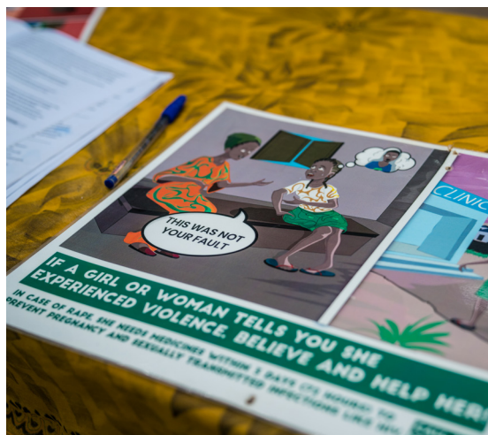
A counselling card showing what to do if a girl or woman discloses to you that they have experienced violence from the 'Social and Emotional Learning' and 'School-Related Gender Based Violence Prevention and Response' training courses delivered to students in schools and adults in communities in Sierra Leone.

We know that when women are left out of the planning and implementing process for community-based humanitarian response, there is a higher likelihood that the needs of women and girls will not be adequately met